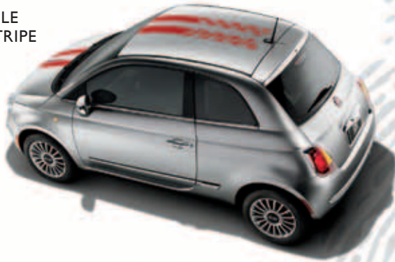
RED DOUBLE RACING STRIPE